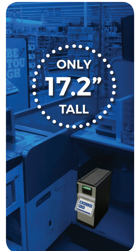
Installed directly at the point of sale