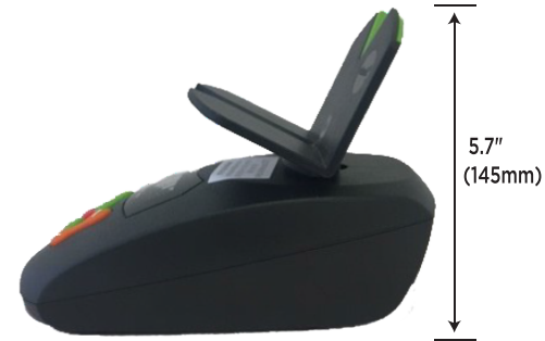
Weight 2 lbs (0.91kg)